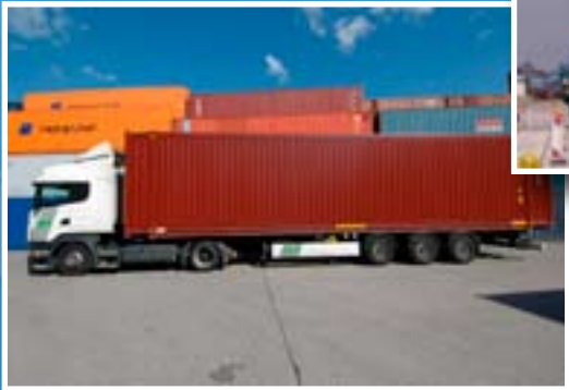
Increased capacity (99 cbm) per container