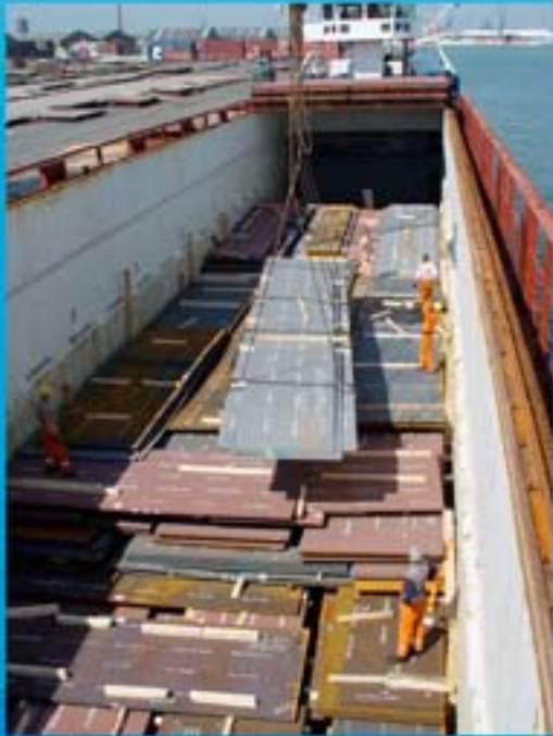
Discharging steel plates