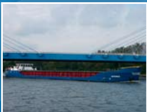
Delivering your cargo inland at your customer's premises, using sea-river coasters