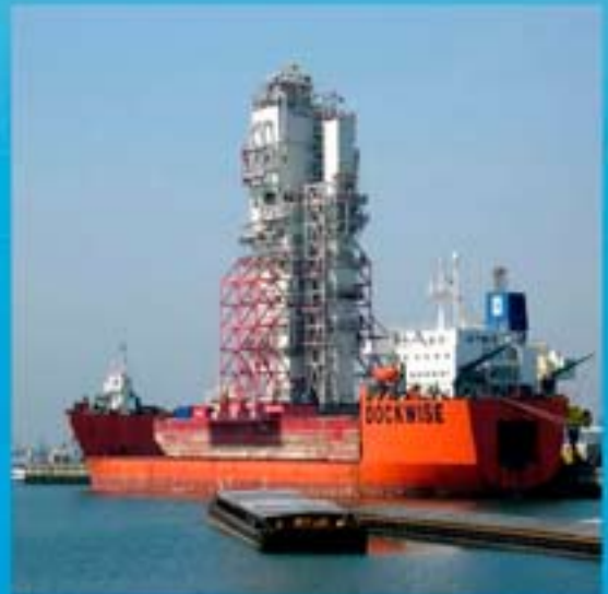
Coldbox to Norway