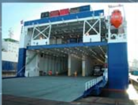
Roll-on Roll-off decks