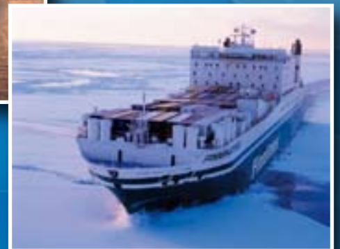
... or under more difficult circumstances