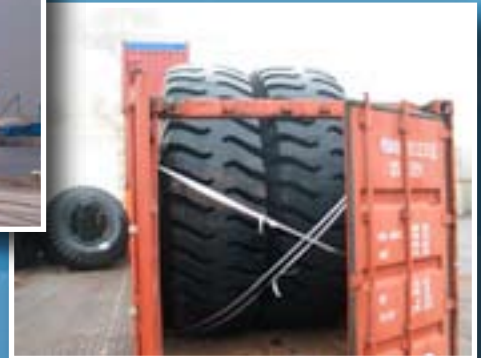
Cargo in all sizes