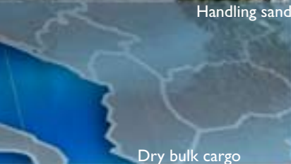
Dry bulk cargo