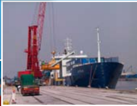
Adapted vessel construction for specific cargo such as paper