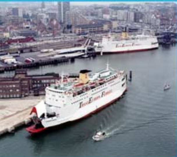
Ferry (trucks and passengers)