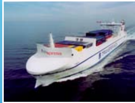
Modern vessels with increased capacity