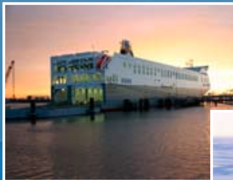
Just to cross the Channel...