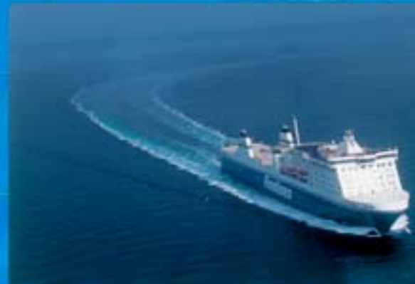
Ro-pax (Rolling Material and Passengers)