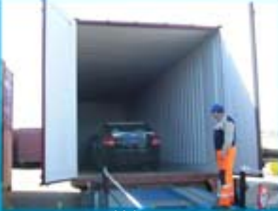
Volvo cars in containers